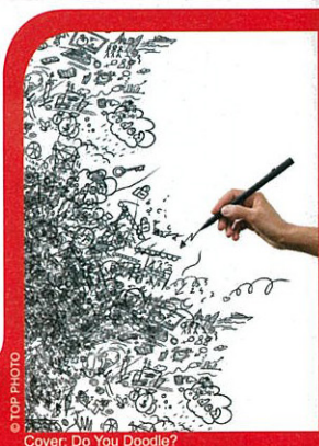
Cover: Do You Doodle?